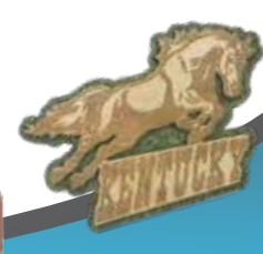
07-39 All Designs © Bicast